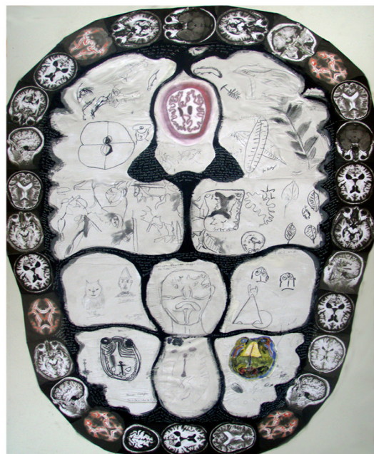
Interior Mapping Systems , mixed media.