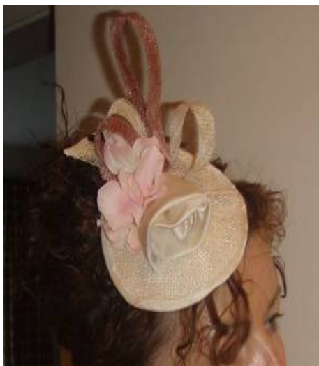
Examples of fascinators and stained glass Christmas decorations made by staff during art workshops for staff members at AMNCH.

We have also revamped our website www.amnch.ie/Departments-Clinics/Departments-A-Z/Arts-National-Centre-for-Arts-and-Health/ and created a series of patient information leaflets. We also offer patients a short information sheet when leaving hospital advising how to continue art making at home, with resources for buying materials and courses in their area.