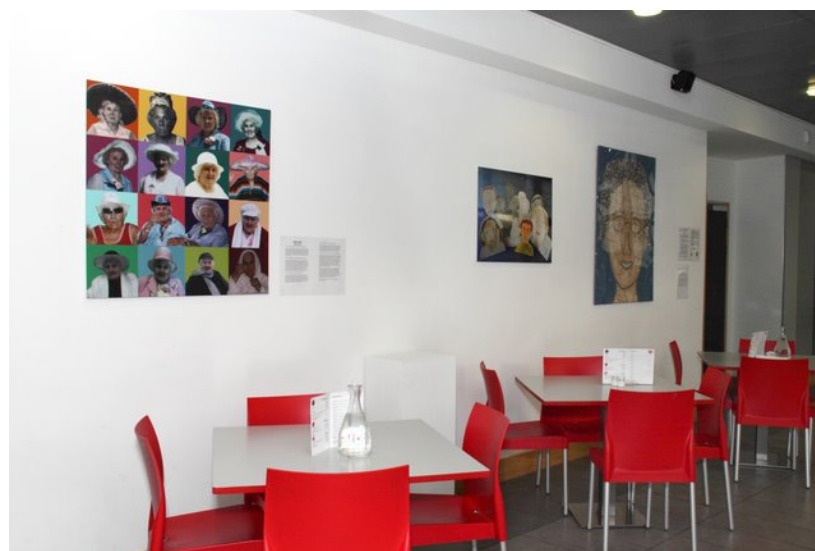
Memory Found exhibition on display at the National Exchange Day at Rua Red Arts Centre.

In December 2011 we co-hosted the national day of the Dialogue Arts + Health project, a series of meetings which aimed to bring together artists who are experienced or interested in developing contemporary art projects in healthcare settings. A series of peer-to-peer Dialogue Sessions took place in Galway, Cavan, Limerick and Offaly and these culminated in a national day at RUA RED Arts Centre. For full details of partners please see our website.