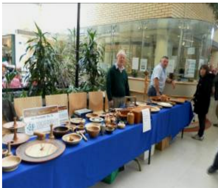
Dublin Chapter of Wood Turners exhibiting in the main atrium