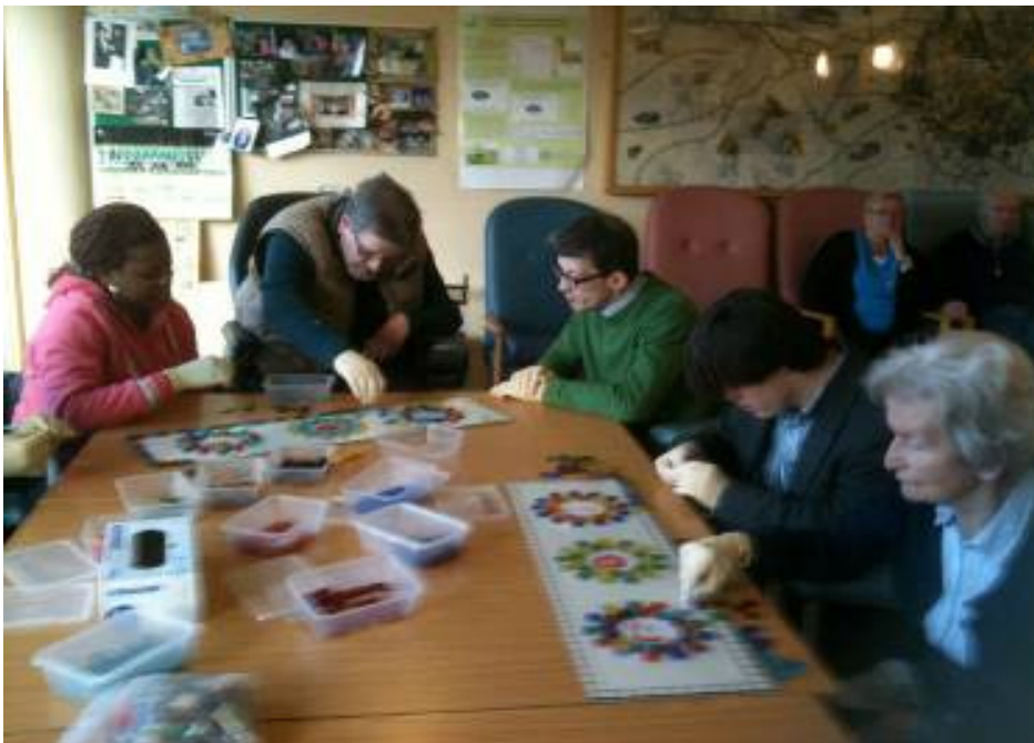
Patients enjoying the art project in the Age Related Day Hospital